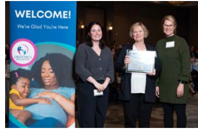
UP Health System – Marquette earned a statewide award for safely reducing cesarean births.