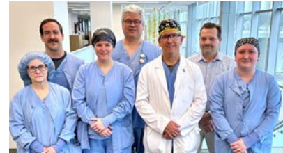
UP Health System – Marquette now offers a new treatment option for atrial fibrillation.